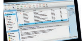
send an email