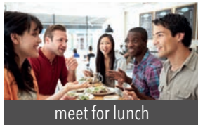
meet for lunch