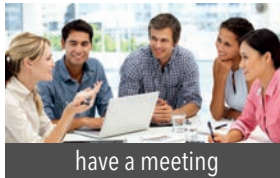
have a meeting

B What's happening? Label the captions. Use words from 1A.