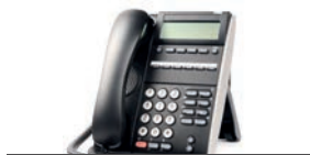
leave a voicemail message