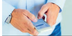
send a text